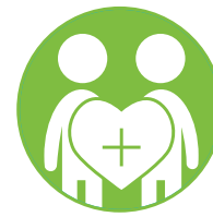
Health and high-risk behaviors

The action plan also identifies the main stakeholders responsible for implementing each of these interventions; which include 17 Ministries, public institutions, civil society organizations, educational institutes, health centers, municipalities and international NGOs. The plan also includes a framework for monitoring and evaluating recommendations and interventions.