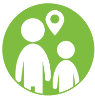
Demographics and migration