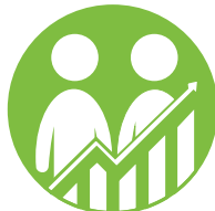
Employment and economic participation