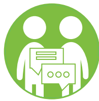
Social integration and political participation