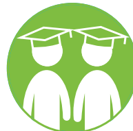
Education and culture participation