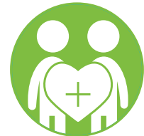
Health and high-risk behaviors