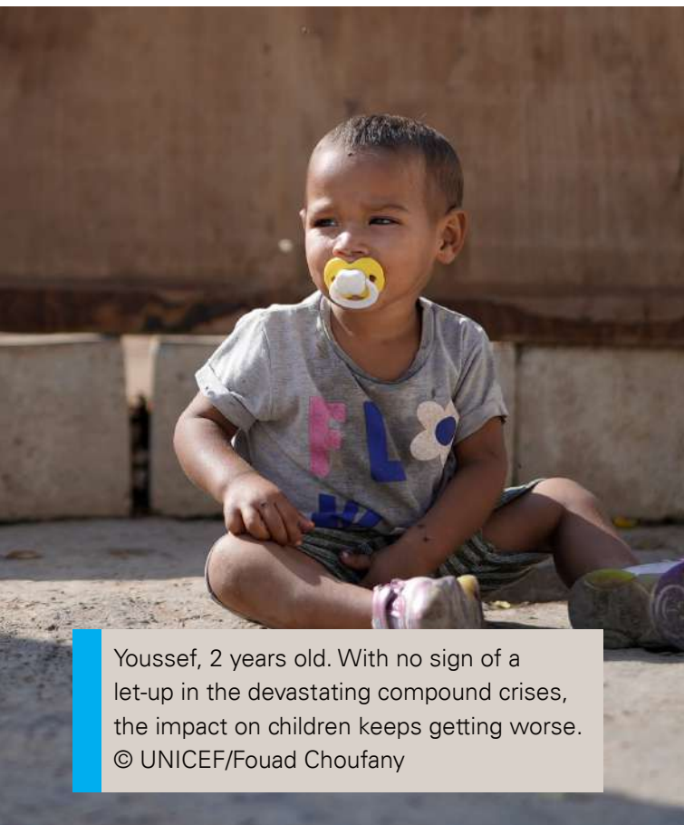
Youssef, 2 years old. With no sign of a let-up in the devastating compound crises, the impact on children keeps getting worse.

Faced with skyrocketing inflation, rising poverty and increasingly scarce jobs, families are struggling to provide for their children. The CFRA indicates that 53 per cent of families had at least one child who skipped a meal in October 2021, as compared with 37 per cent in April.